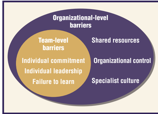
Figure 1. Team- and organizational-level barriers to self-managing software teams. The actual performance of a self-managing team depends not only on the competence of the team itself in managing and executing its work, but also on the organizational context provided by management.